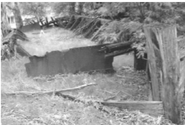
Top: Wagga Wagga remains. Bottom: Whaler barge