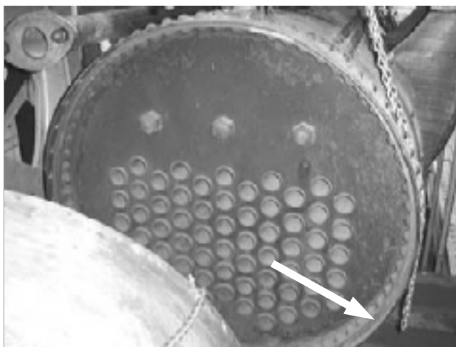
Arrow shows disputed circumferential 'seam' weld position